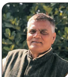
Guest of Honour Shree Sachidanand Bharti Water Conservationist